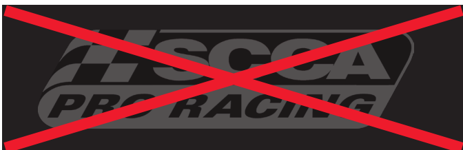
Ghosting of this logo is not allowed