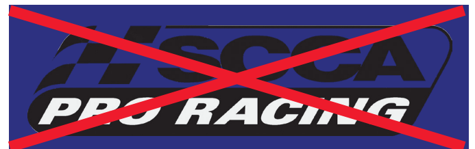
Transformation/manipulation is not allowed